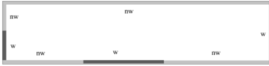
Fig. 3. Scheme of the distribution of wettable and nonwettable areas at the capillary boundaries.

The gray color gradations in the calculated cells presented in Figs. 1 and 2 show the concentration distribution of one of the components present, which practically corresponds to the spatial distribution of the corresponding phase.